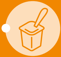
Ambient and frozen foods