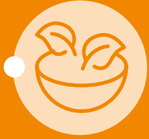
Plant-based meat alternatives