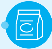
Flat bottomed bags