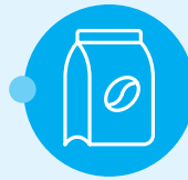
Quad seal bags